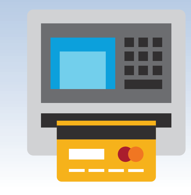
2. Insert Card Long-Edge First