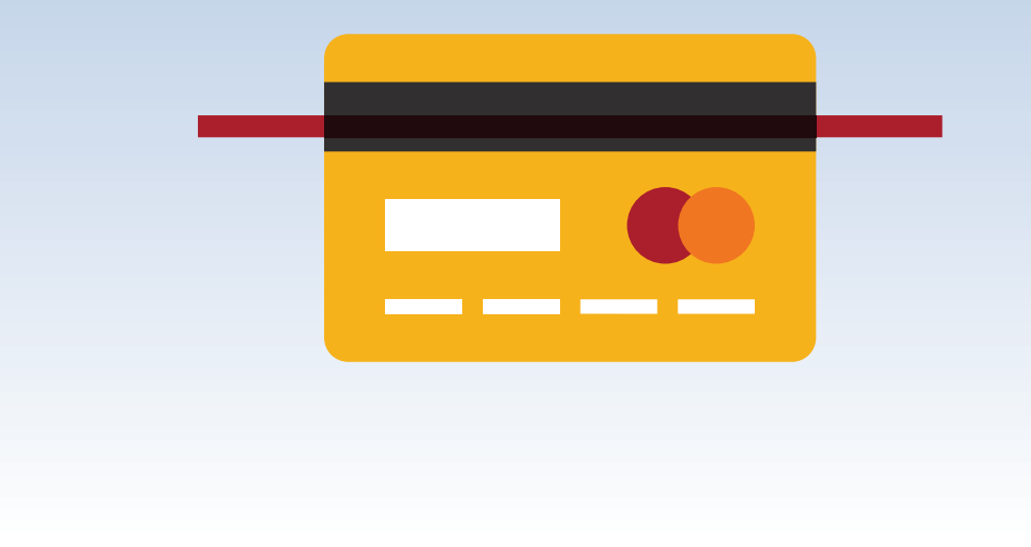
3. A Moving Head Reads the Card Info